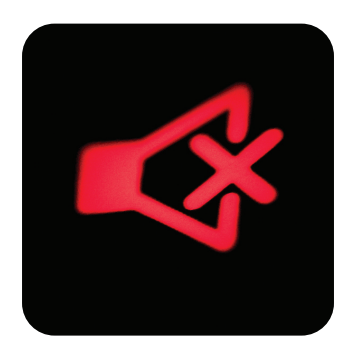
SUPER MUTE MODE

The LCD backlight makes the buttons on the remote light up each time you press them: a feature quite useful if you want to double-check if you have correctly entered a command.